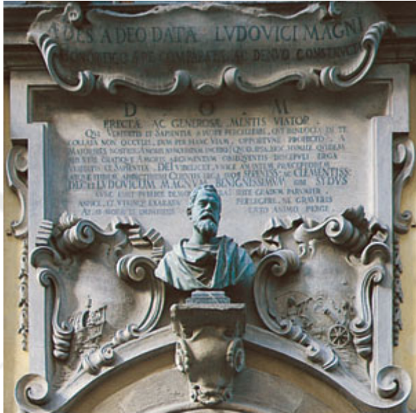
Studio Art Centers International – Palazzo dei Cartelloni